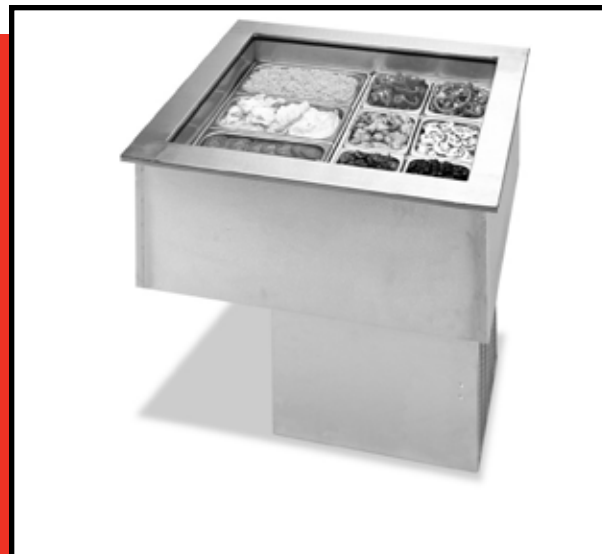
DROP-IN COLD WELL